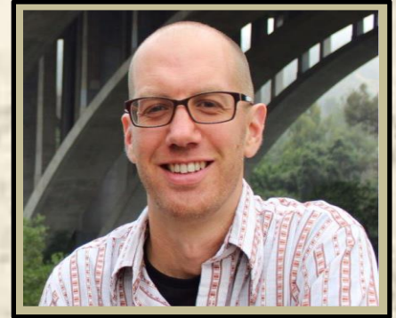
See "Bio" on next page.